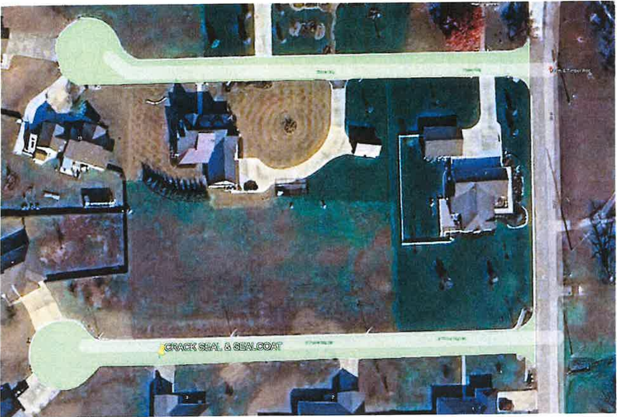
Aerial Map 5 - Neodesha Road Sealing - Timber Ridge Rd