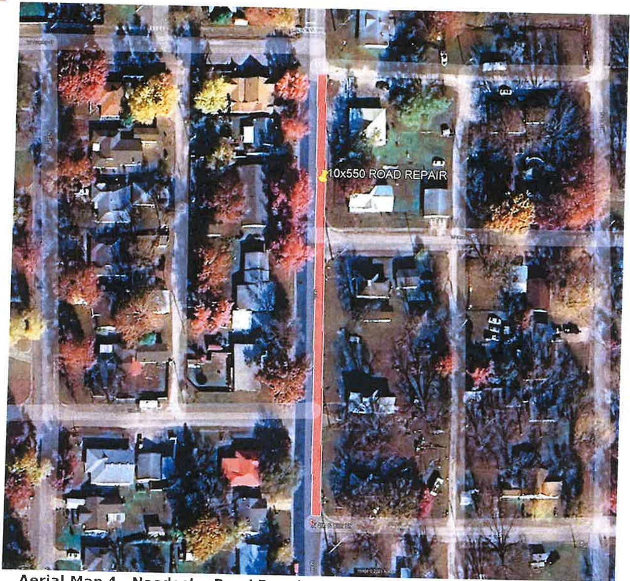
Aerial Map 4 - Neodesha Road Repair - 4th St From Elm St to Granby St