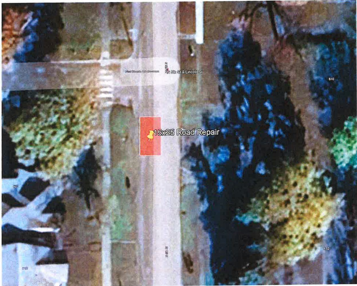
Aerial Map 1 - Neodesha Road Repair - 8th & Lincoln