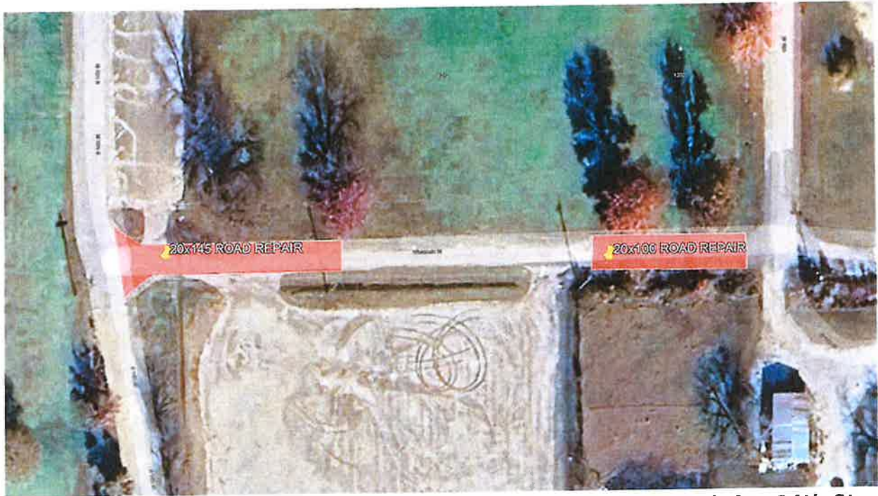
Aerial Map 3 - Neodesha Road Repair - Wisconsin St From 13th St - 14th St