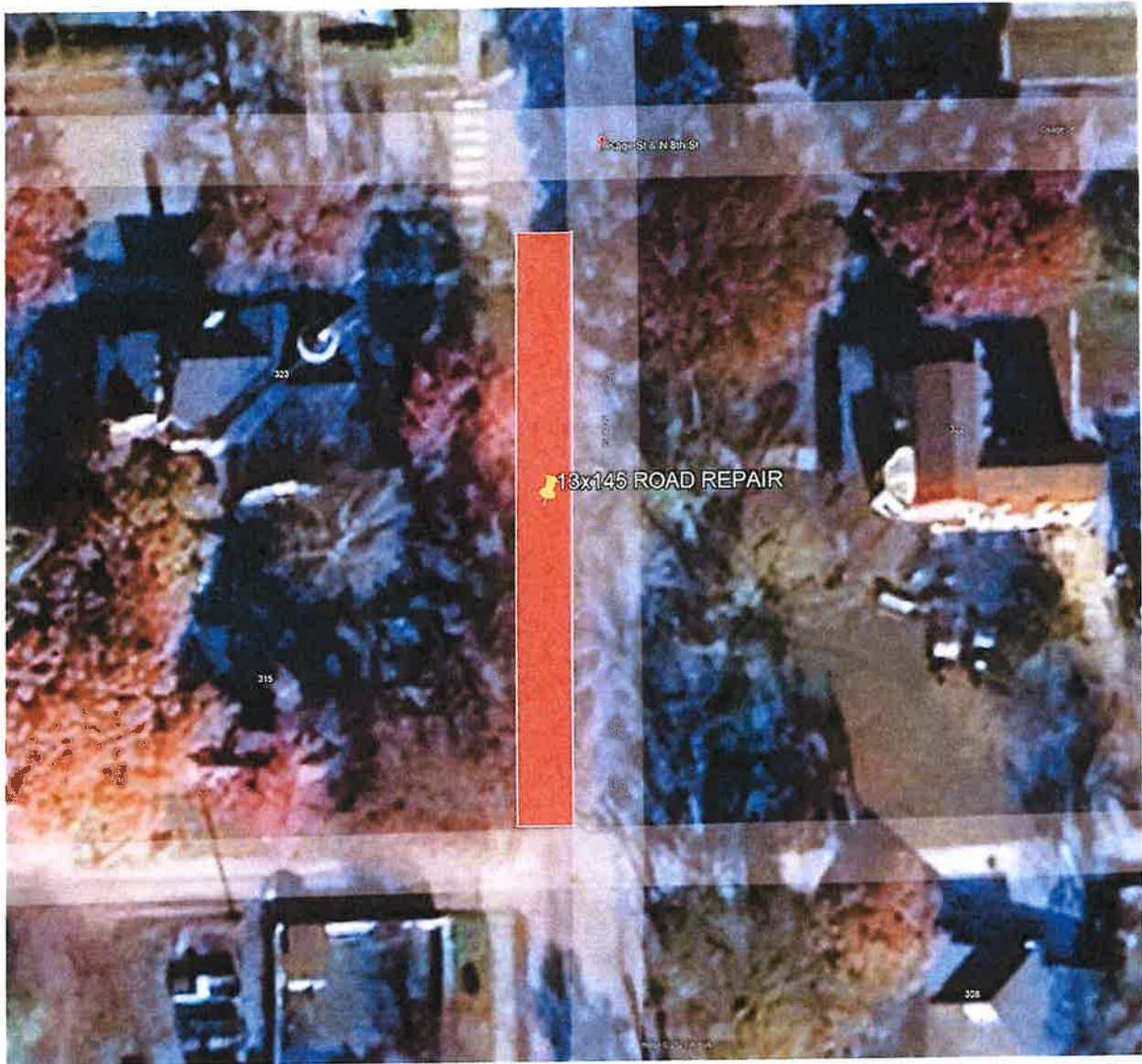
Aerial Map 2 - Neodesha Road Repair - 8th & Osage