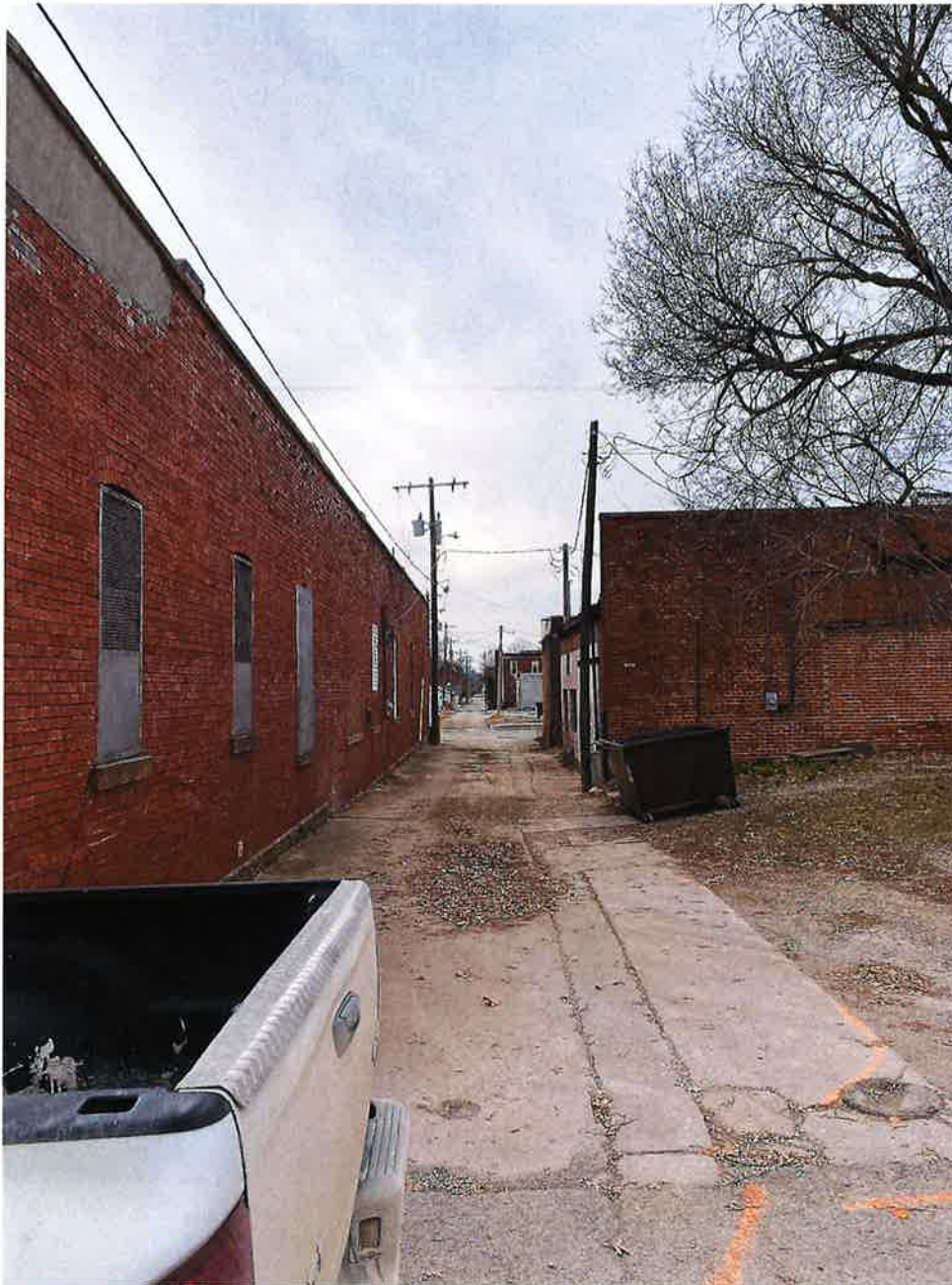
Alley south of Main street facing West toward 611 Main Street

1402 Main St Neodesha KS 66757 (620) 325-4243