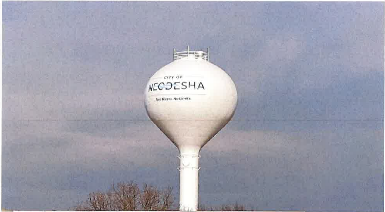
Neodesha Water Tower

1402 Main St Neodesha KS 66757 (620) 325-4243