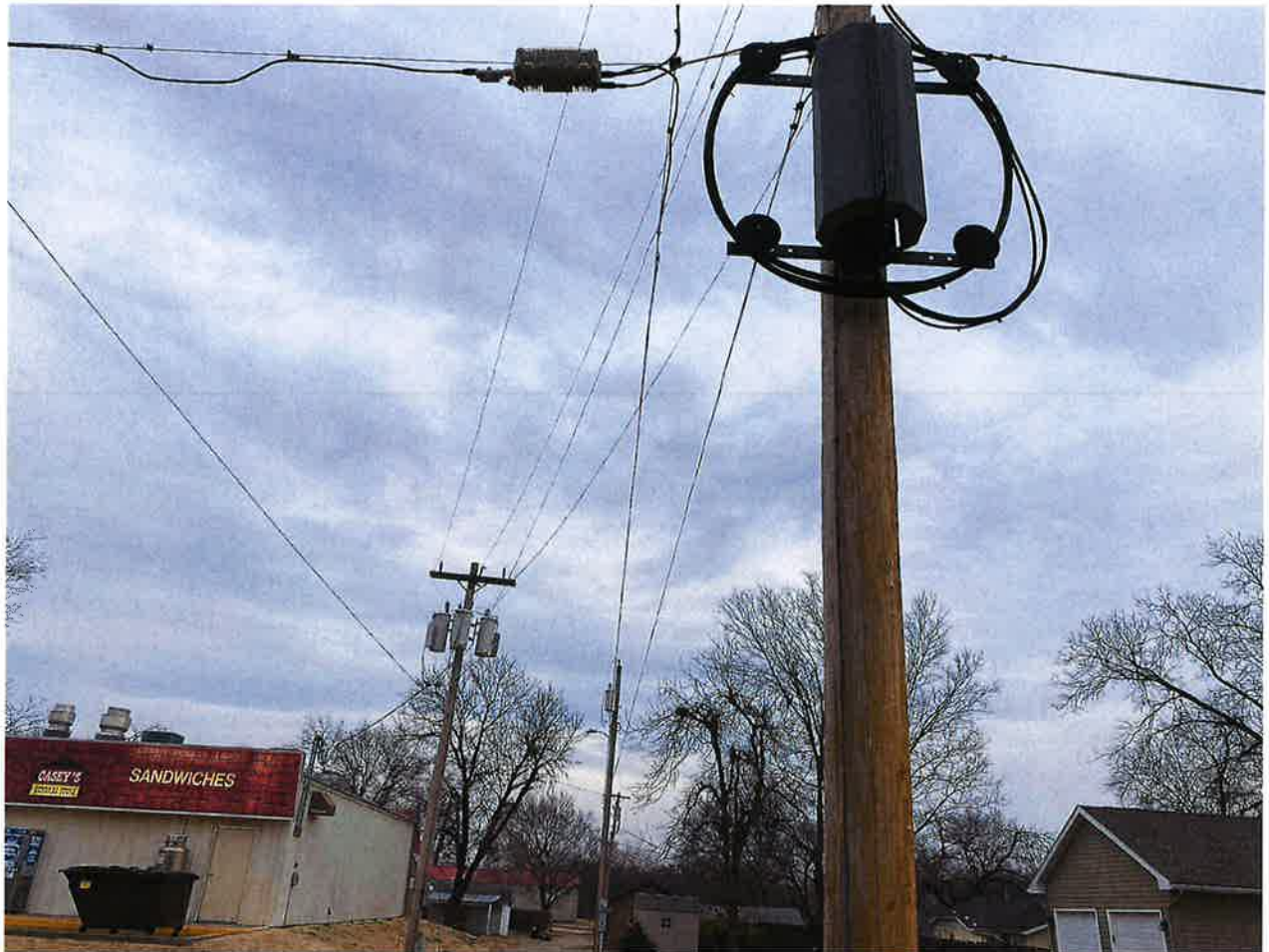
Exiting Splice Point 2nd Street.

1402 Main St Neodesha KS 66757 (620) 325-4243