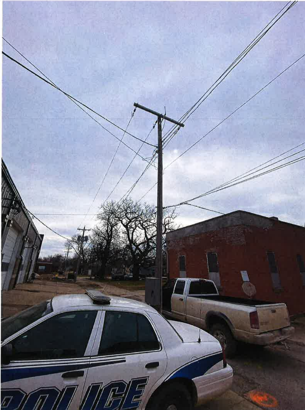
Last Pole with Fiber behind Police/Fire Station